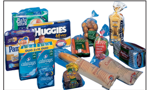
Multiple Wicketing Bag Options